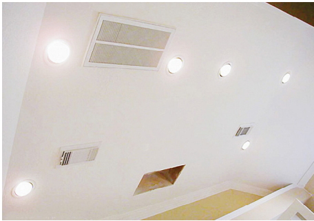
Incandescent light fixtures in the ceiling below the attic can often generate enough heat to melt snow on a roof.

Prevention remains the most effective strategy for stopping ice dams. Homeowners can take several steps to prevent heat from escaping your attic or the interior of your house.