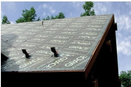
Snow and ice shield.

Re-roofing also offers another opportunity to prevent ice dams. During installation homeowners can install a secondary moisture or snow and ice barrier to prevent heat loss. To make sure the barrier is effective homeowners should consider using two layers of underlayment that are cemented together.