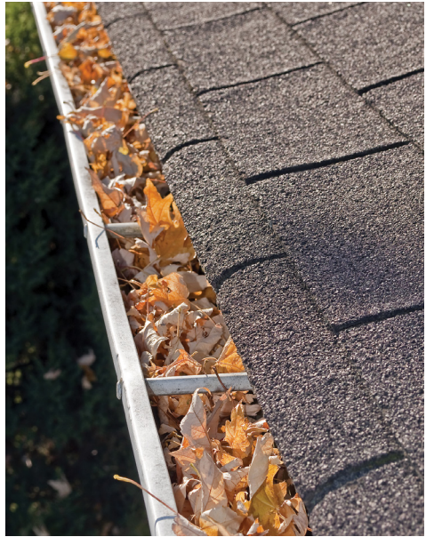
Blocked gutters can stop water from draining from your roof and cause ice dams.