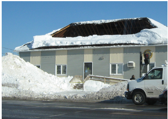
Roof collapse can be a stressful and expensive experience for homeowners.

But even with a sloped roof, snow and ice can still build up on flatter areas of the roof. Obstructions, such as chimneys, skylights or dormers, are particularly susceptible to snow build-up.