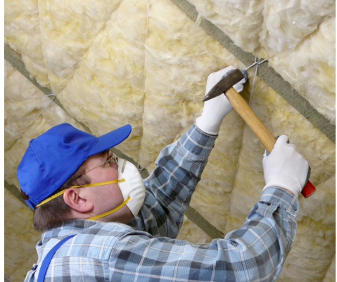
Fibre glass insulation can significantly reduce heat loss from your home.

For some homes, especially those with aging drainage systems that are surrounded by trees, this type of preventative maintenance may still not stop ice dams. In this case, a heating cable installed on the gutter or downspout may be necessary.