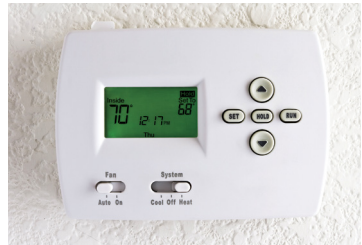
It is important that during cold snaps that the temperature is not set any lower than 12 Celcius.

Power outages are one of the more common causes of frozen pipes. Without power, the water supply may also shut off. If you do not flush water out of the pipes it can easily freeze. During the 1998 Montreal Ice Storm, for example, power outages led to significant damage in many homes from frozen pipes.