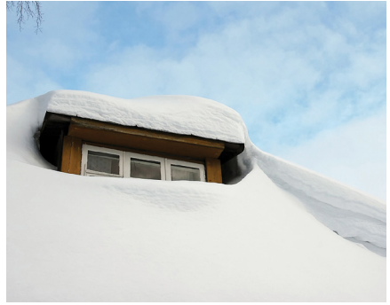
Snow can collect behind roof obstructions, such as the ones pictured above. These include vents, chimneys or gables.

In the aftermath of significant snow or ice event, there are several important indicators a homeowner can use to determine if a sloped roof is under structural stress from snow or ice. The Canadian Mortgage and Housing Corporation (CMHC) recommends that homeowners check for 1 :