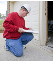
Home inspectors can help assess a home's capacity to withstand storm-force winds.

Because each home is different, building inspectors can offer important insights into your home's capacity to withstand storm-force winds. Inspectors can provide important information on the age of your home, and its capacity to resist extreme winds. Contacting your municipality is the easiest way to find a good home inspector with knowledge on your area.