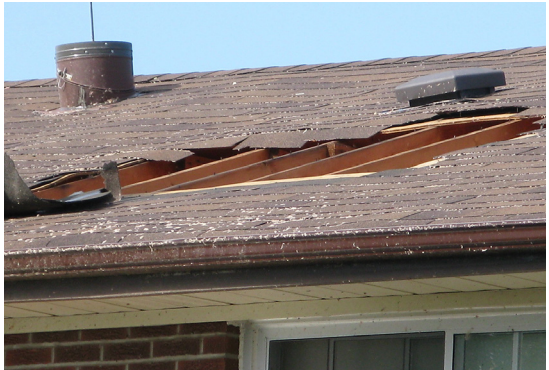
Roof sheathing must be securely fastened to prevent wind damage.

Choose a high-wind rated roof cover and make sure ridge and off-ridge vents are also rated for high winds. If a homeowner is not ready to re-roof, check vents to be sure they will stay in place and are of the proper type and strength to resist high winds and wind-driven rain.