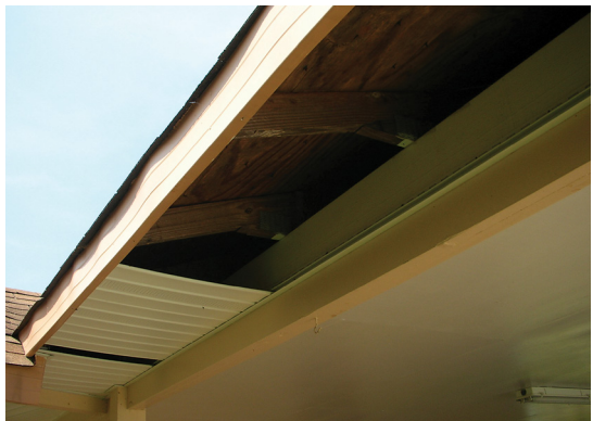
During a storm, the eaves of a home can expose the structure to the ravages of wind-driven rain.

During a storm, the eaves of a home can expose the structure to the ravages of wind-driven rain on two fronts. The most obvious danger comes when soffits are blown out during a storm. Water intrusion can also occur when strong winds drive water through vented soffits. Homeowners should check the condition of their soffit covers