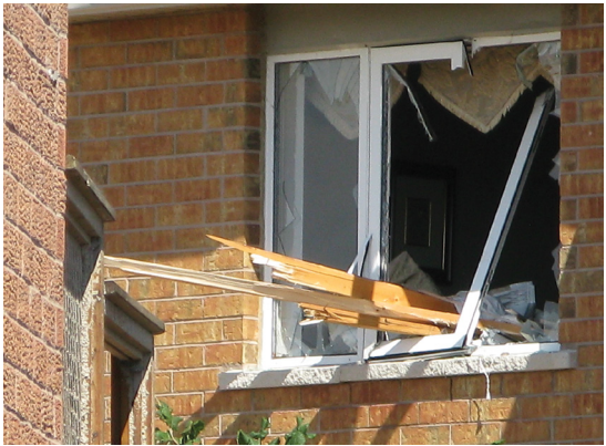
Flying debris from severe winds can easily penetrate unprotected windows.

Although tornadoes and severe winds can exert tremendous pressure against homes, a significant portion of property damage is not from the wind itself but from airborne materials. Items such as tree limbs and branches, signs and sign posts, roof tiles and shingles, metal siding and other pieces of buildings (including entire roofs in major storms) can easily penetrate unprotected windows and sliding doors. This wind-borne debris can cause significant damage to interior walls and ceilings not designed to withstand such forces. As well, wind penetration results in the uncontrolled build-up of internal air pressure which can weaken the structure.