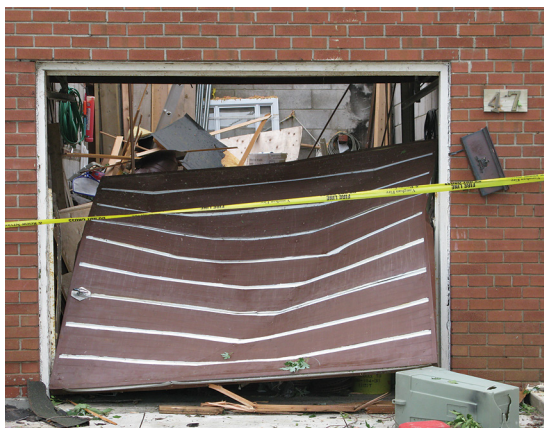
Garage doors can be the weakest opening of a home in a severe wind storm.