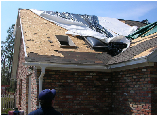
High winds are a major cause of roof damage.